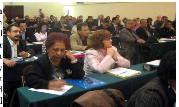
National meeting of Roma NGO for discussing the Roma integration strategy

structural funds, media training. Roma NGOs, community-based organizations and informal groups all over the country took part in them: