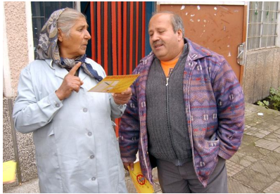
Roma campaign for participation in the local elections

• Fostering networking and coalition-building: Center “Amalipe” has stimulated the process of establishing coalition/network of Roma NGOs through organizing exchange of information and know-how, common advocacy activities, meetings of organizations that work in common field (for example Roma health organizations, Roma women organizations, etc.) and national meeting of all Roma organizations. These activities tend to overcome the controversies among most of independent and working Roma organizations and to form their network based on shared values, goals, and approach.