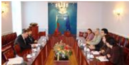
Meeting of Roma NGO representatives with the Minister of Health

To overcome this situation Center “Amalipe” undertook the following activities for civil society mobilization: